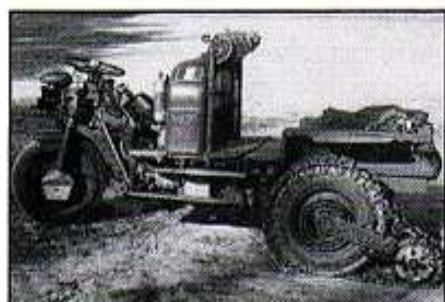
By lowering the rollers and installing the overall tracks the Mulo becomes a half-track. Driver's back rest is in fuel tank recess. The machine was an overkill, expensive and unsafe.