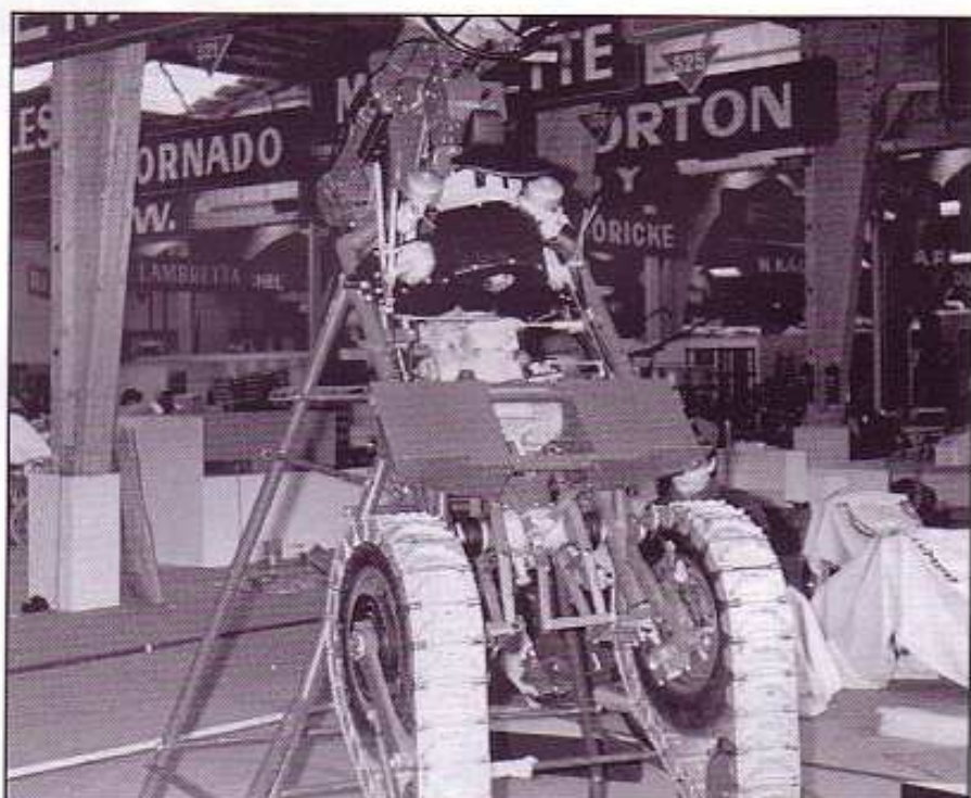
This is how we first saw the 3×3 trike — still in prototype form — at the Geneva Motor Show in March 1960.