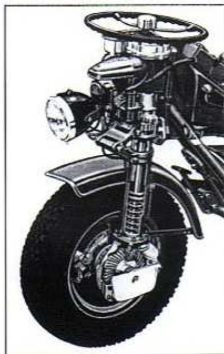
Cut-away view of the production front end.

The preliminary end result was exhibited at the Geneva Motor Show in March 1960. The highly unorthodox machine was described as 'a motorized mountain-goat, with hydraulically reducible rear track to let it pass