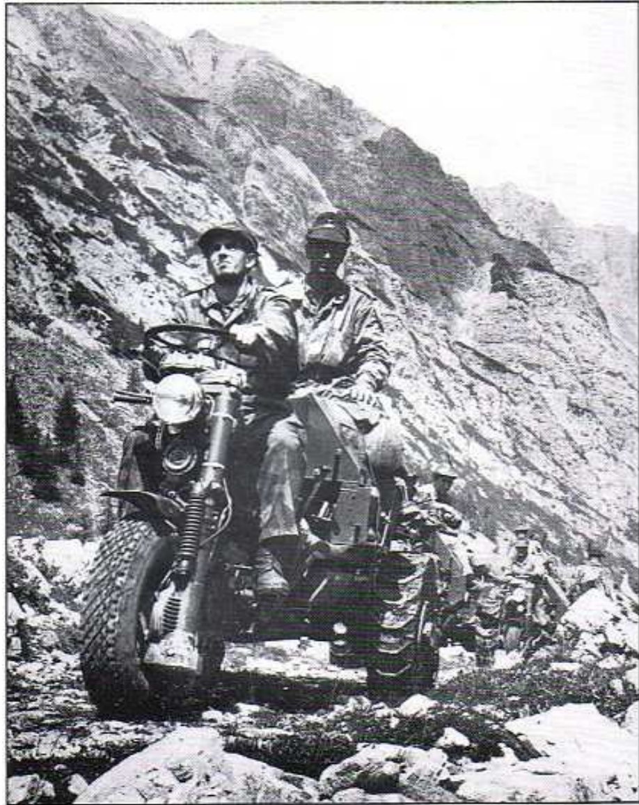
Pilot models — recognisable by different steering column and other details — under test. Upper left picture shows reduced rear track; this narrowing down (and vice versa) could be accomplished on the move, within 25 metres travelling distance.

The manufacturer of the legendary Moto Guzzi motorcycles was approached for a solution and the firm's gifted designer Giulio Carcano was charged with the project. He envisaged a compact highly manoeuvrable three-wheeler with all-wheel drive. Our notes of around 1960 indicate that the original intention had been to use a 500-cc single-cylinder engine based on the one that had proved itself in such machines as the Guzzi 500U 3x2 Motocarro Militare, a robust high-torque slogger. This, however, proved not powerful enough and Carcano then set out to create an entirely new V-twin engine which he placed transversally in the frame so that the crankshaft was in line with the chassis and under such an angle that the drive in both directions was parallel, reducing the need for additional gearing to a minimum.