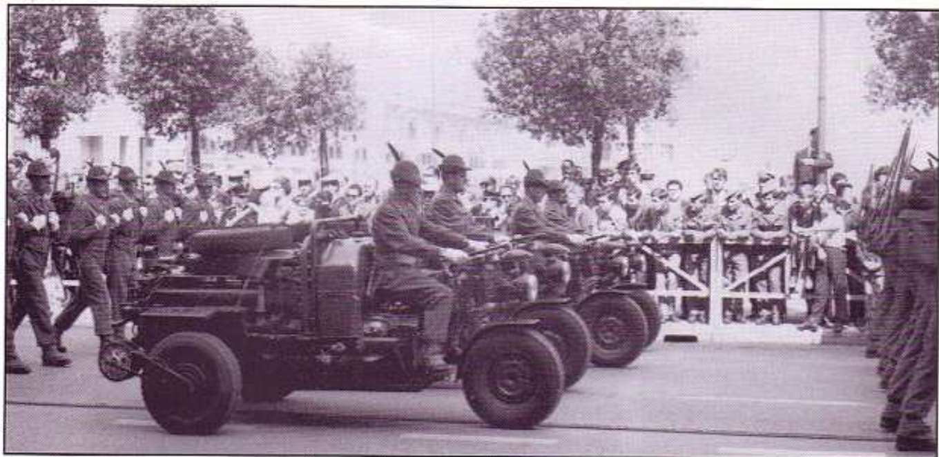
Alpine troops in their traditional garb parading with regulation-loaded Mules in the early 1960s. (Fabio Basilisco)