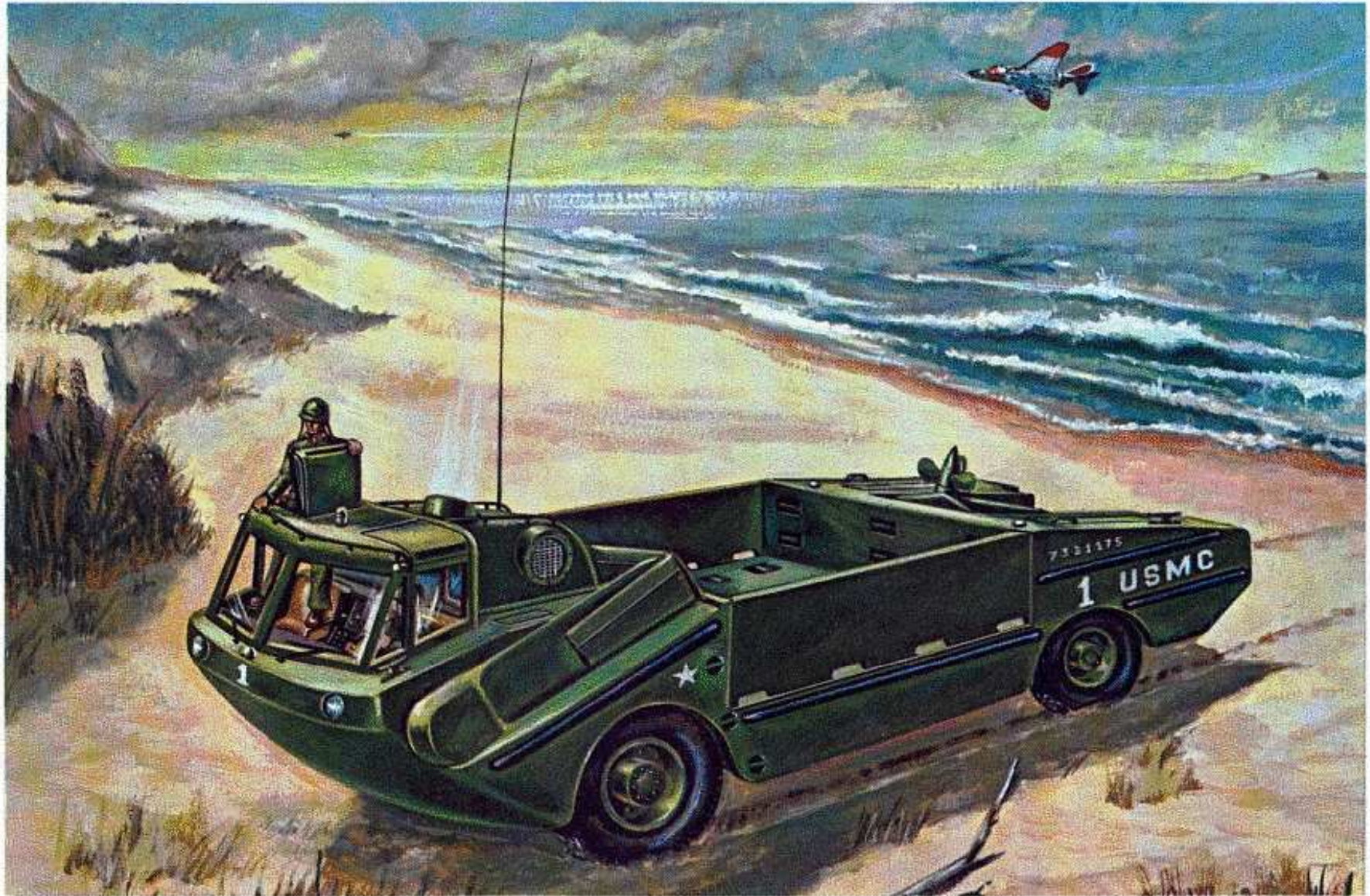
LANDING FORCE AMPHIBIOUS SUPPORT VEHICLE, HYDROFOIL (LVH)

Developed by Lycoming Division under contract with the Bureau of Ships for the U. S. Marine Corps