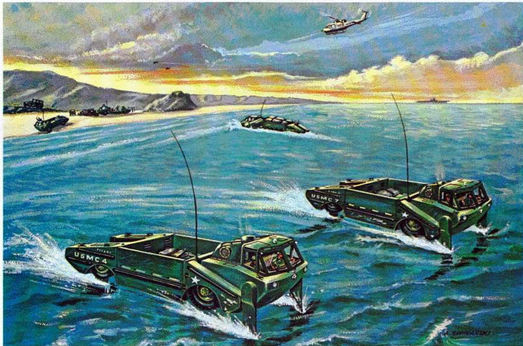
LANDING FORCE AMPHIBIOUS SUPPORT VEHICLE, HYDROFOIL (LVH)

Developed by Lycoming Division under contract with the Bureau of Ships for the U. S. Marine Corps