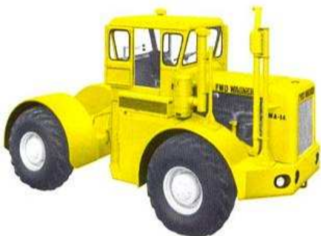
Model WA-14—220 H.P. Farm Tractor