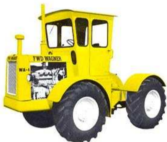
Model WA-4—125 H.P. Farm Tractor