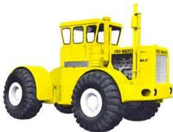
Model WA-17—250 H.P. Farm Tractor