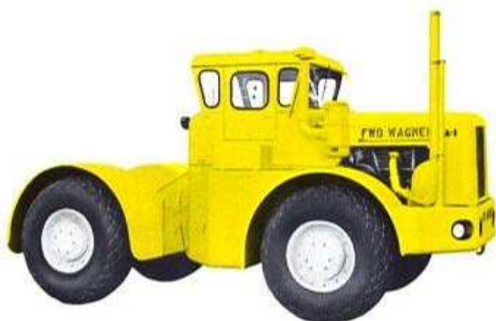
Model WA-9—160 H.P. Farm Tractor