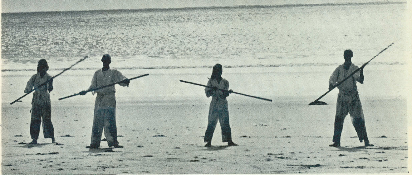
A group of Japanese and English making keiko during a gasshuku by the Pacific ocean in central Japan.

There was a warm breeze blowing, as I strolled down the hill. It felt pleasant as it brushed my face and the trees were being gently washed in its stream. There was a certain softness to it and I could feel spring was near. The wind played on the surface of a pond causing various patterns to appear and as quickly again to vanish. Nature was beginning to have a party. Looking at the renewal about me, crocuses were turning out to meet the sun and some fresh green buds popping out of olive brown branches, brought to mind the renewal of our own bodies and minds. In my last article I wrote of the need for a fresh mind and that also goes for our body and Keiko. Now that spring is here and we feel to renew ourselves, it is perfect to begin Hitori Keiko. That is the study of Keiko alone. Of course, we can